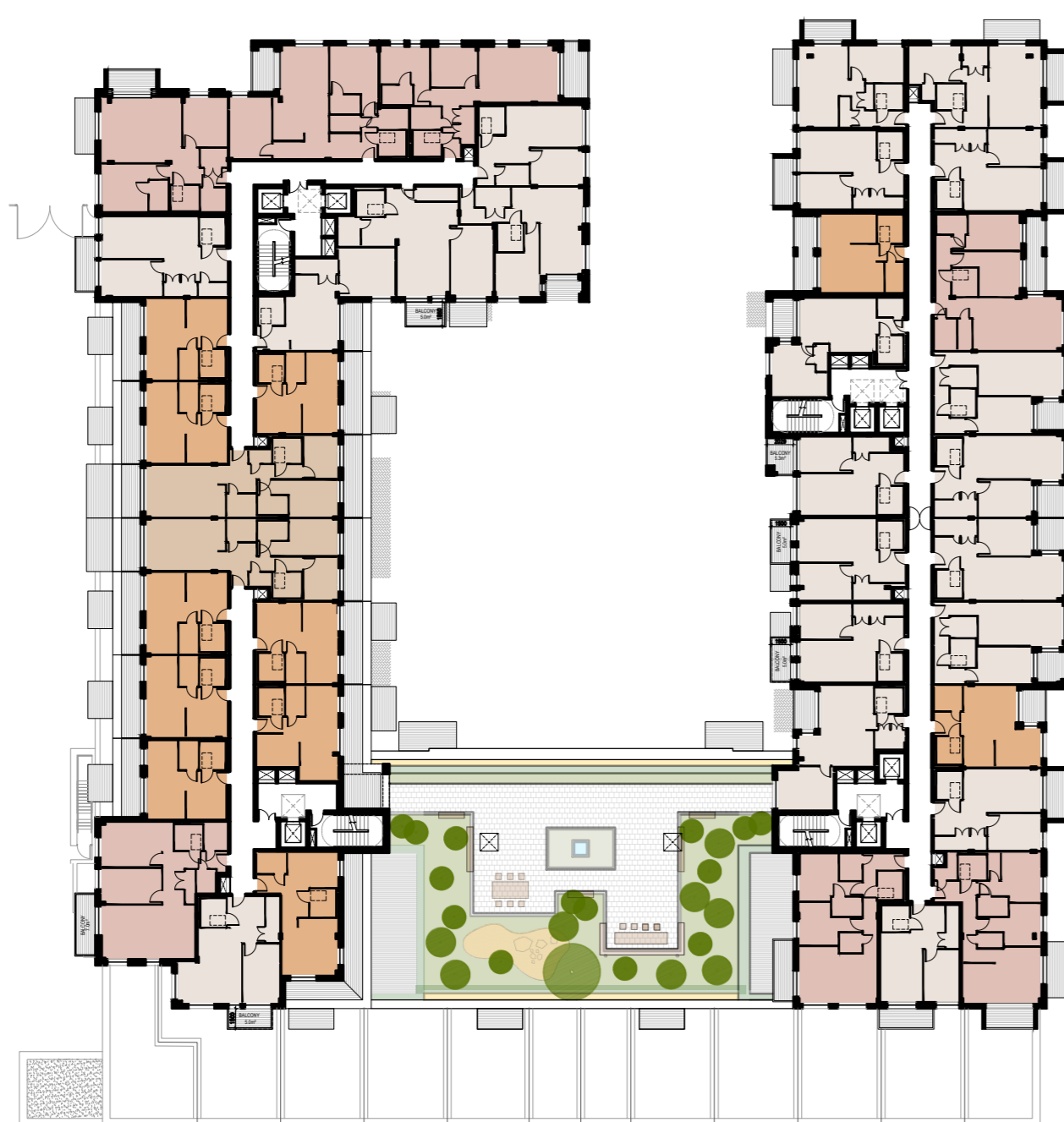
08 Unit Types Plan - Seventh Floor Plan 1:500