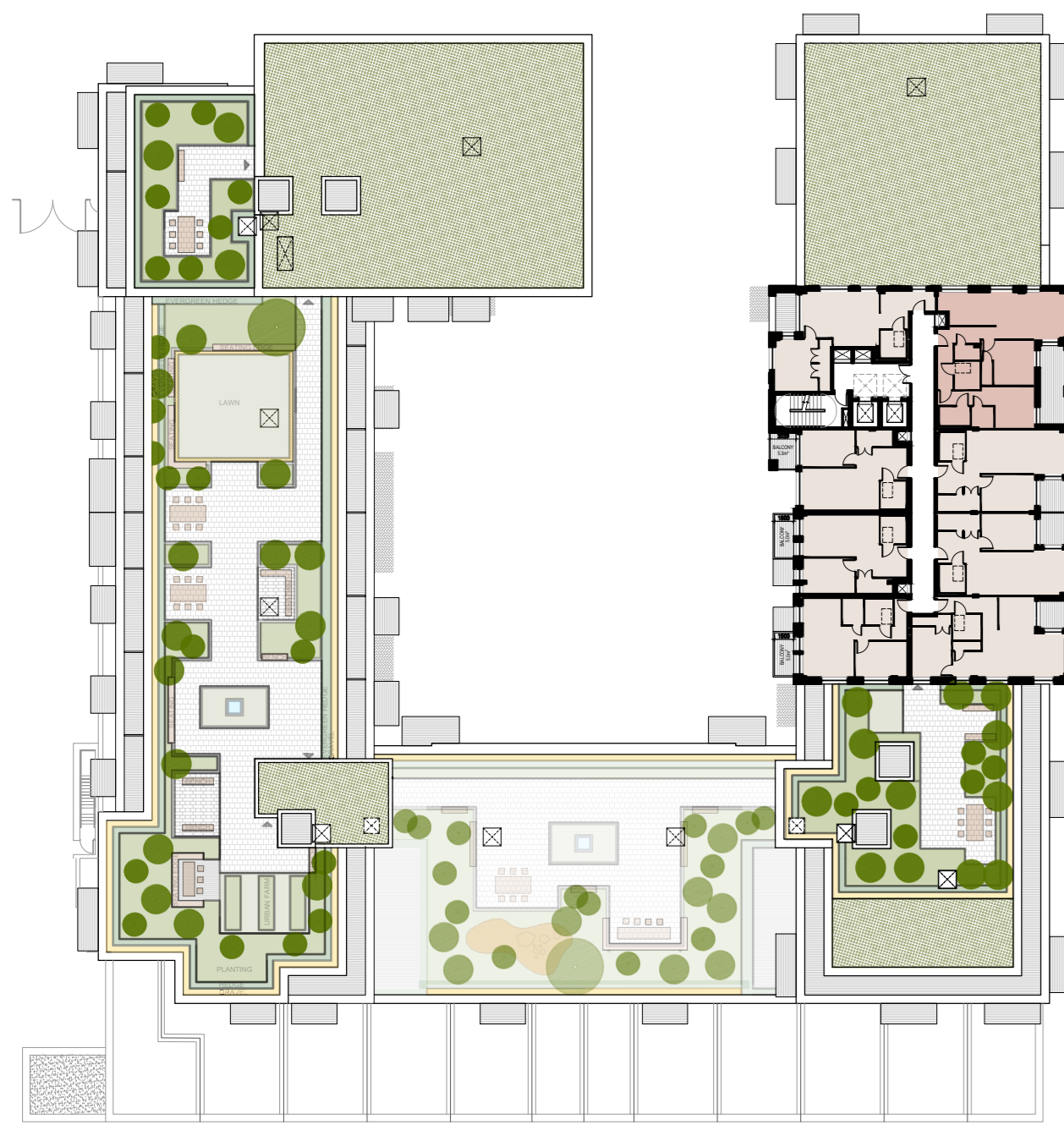
13 Unit Types Plan - Twelfth Floor Plan 1:500