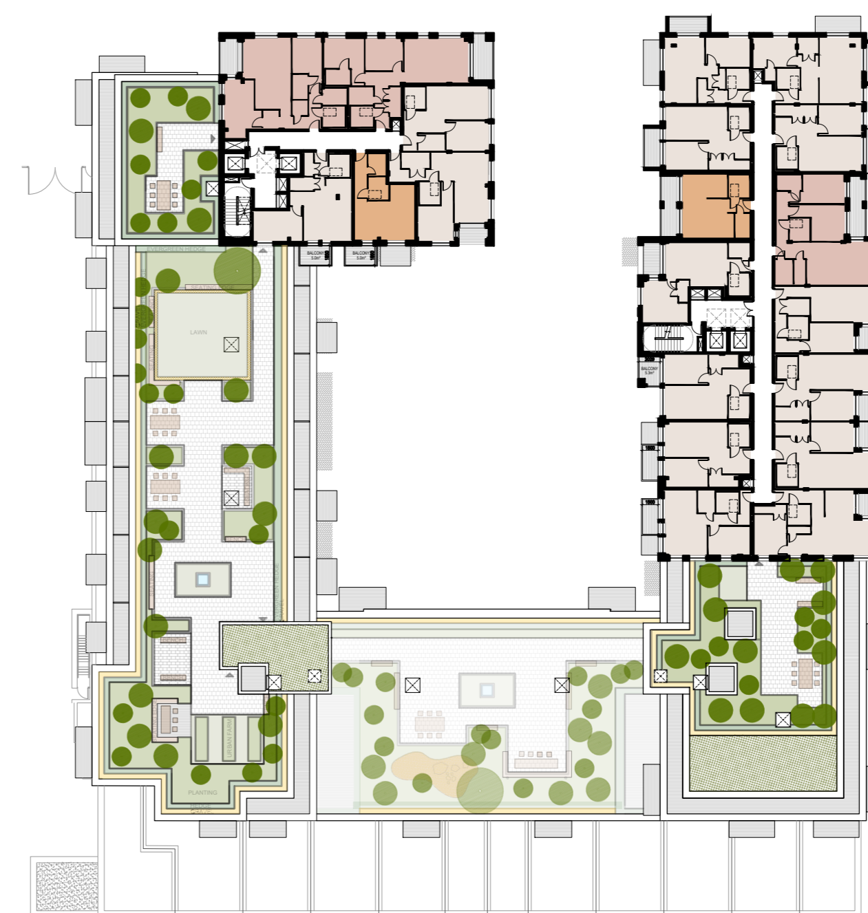
11 Unit Types Plan - Tenth Floor Plan 1:500