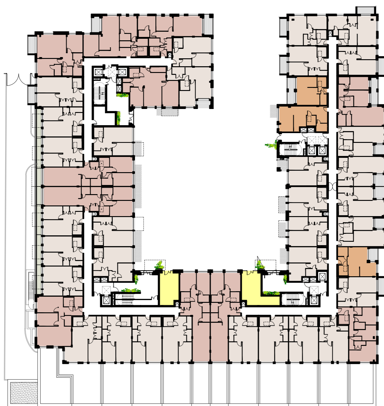
02 Unit Types Plan - First Floor Plan 1:500