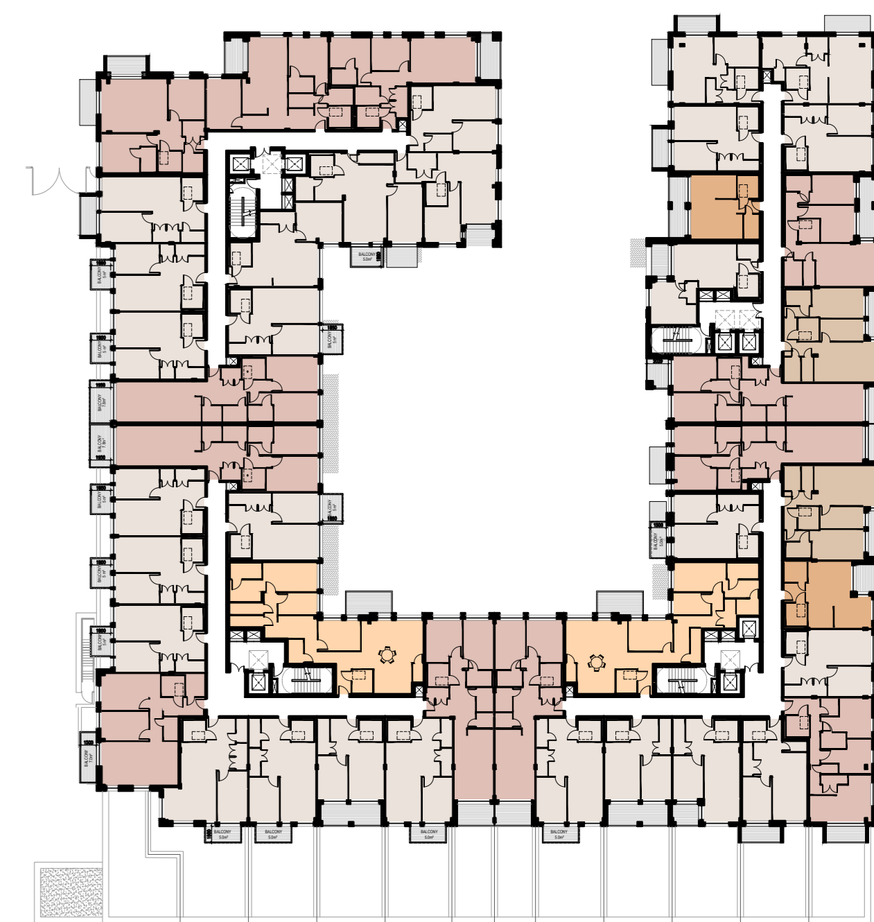
06 Unit Types Plan - Fifth Floor Plan 1:500