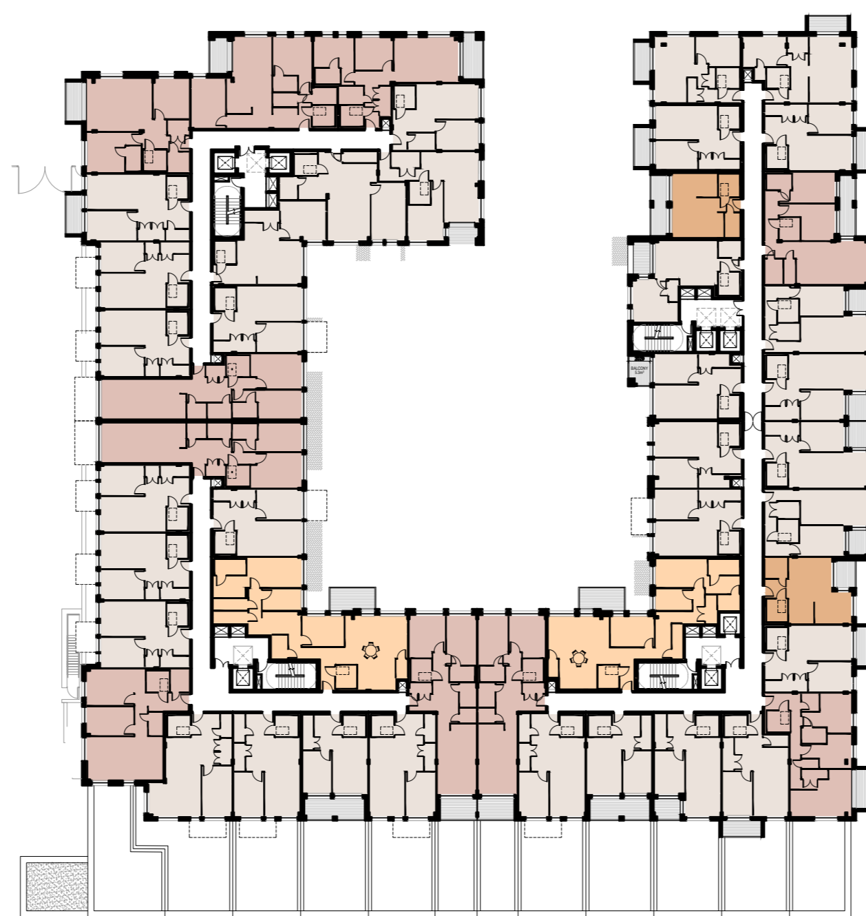
03 Unit Types Plan - Second Floor Plan 1:500