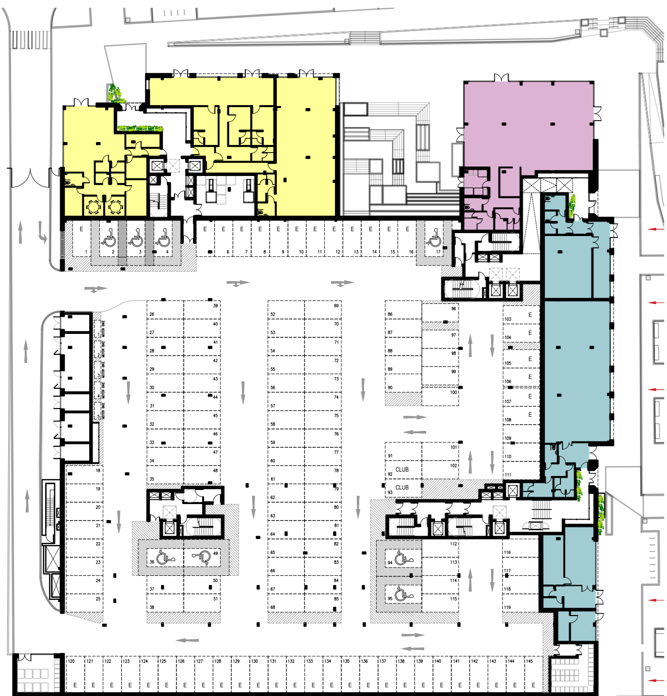
01 Unit Types Plan - Ground Floor Plan 1:500