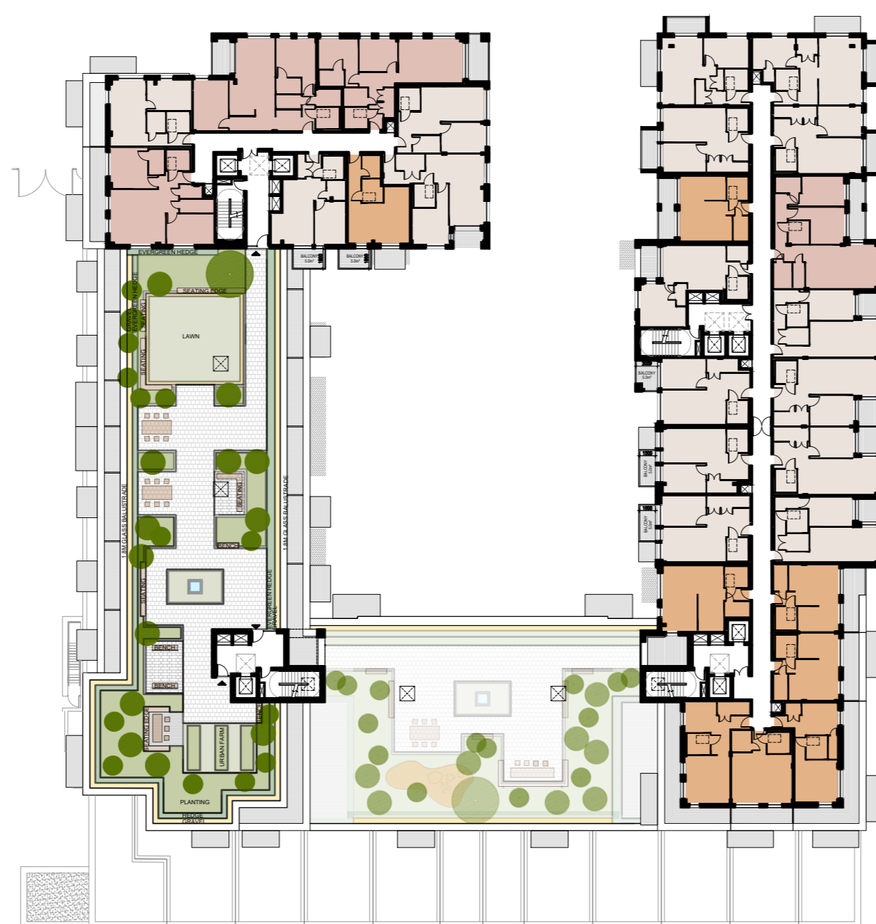
09 Unit Types Plan - Eighth Floor Plan 1:500