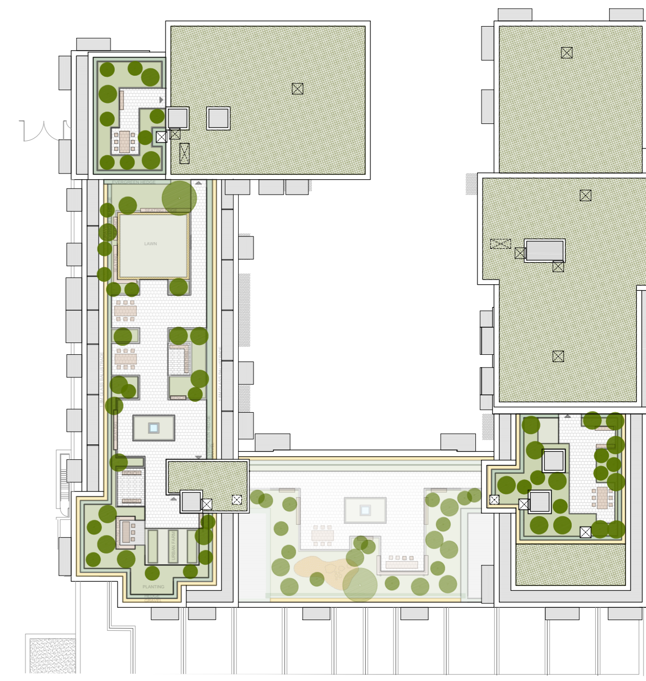
18 Unit Types Plan - Roof Plan 1:500